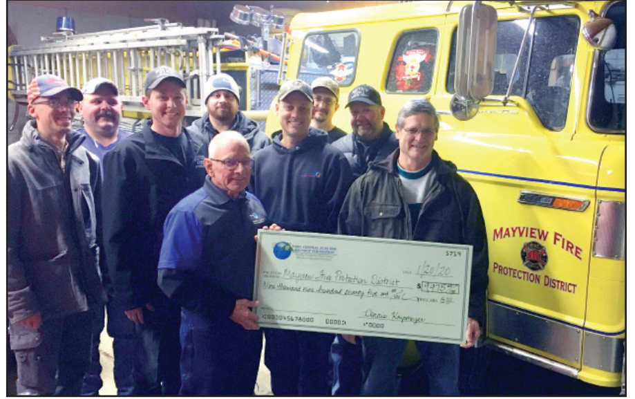
Mayview Fire Protection District