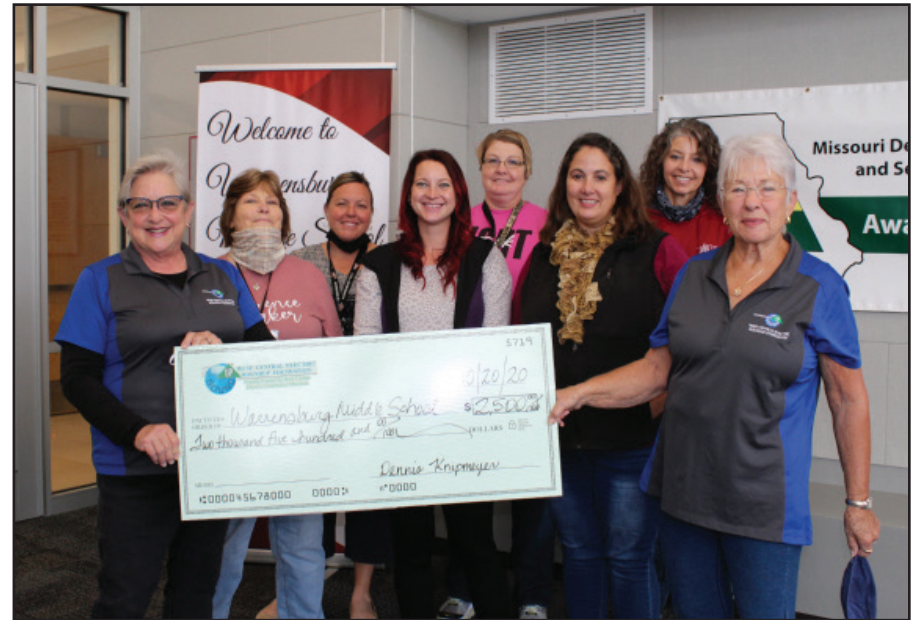
Warrensburg MS Explorers Team