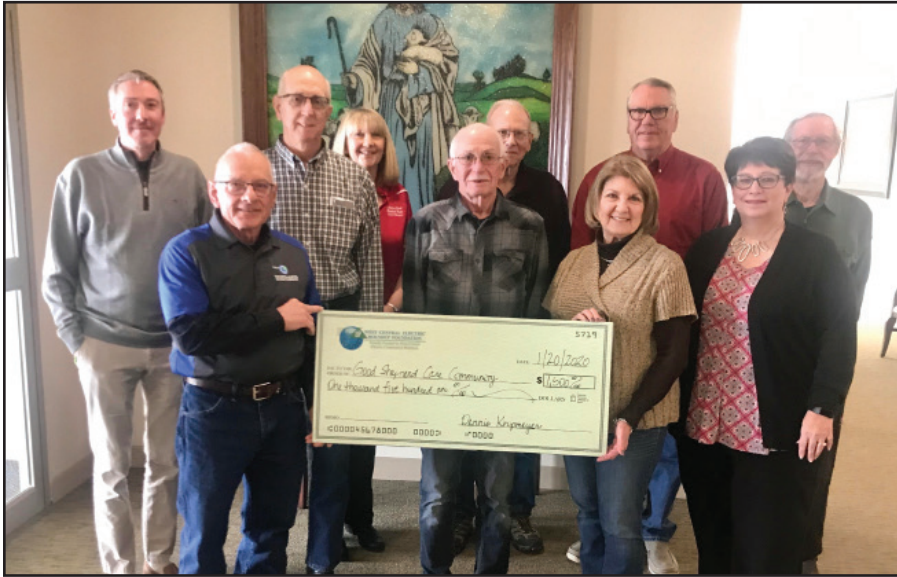
Good Shepherd Care Community