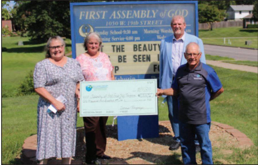
Assembly of God Good 360 Program