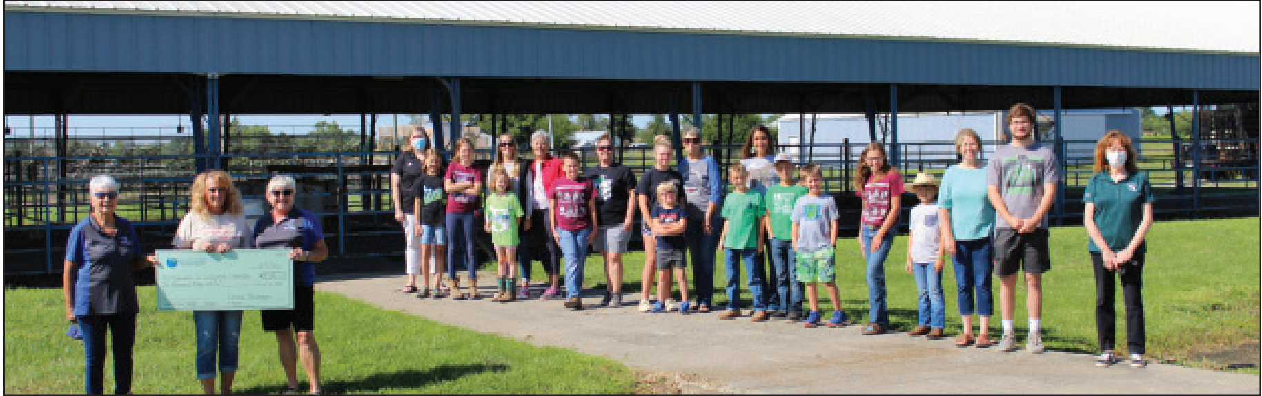
Johnson County Livestock Committee