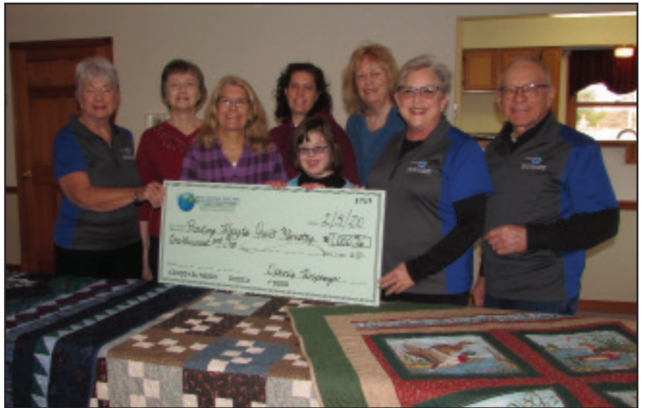
Binding Hearts Quilt Ministry