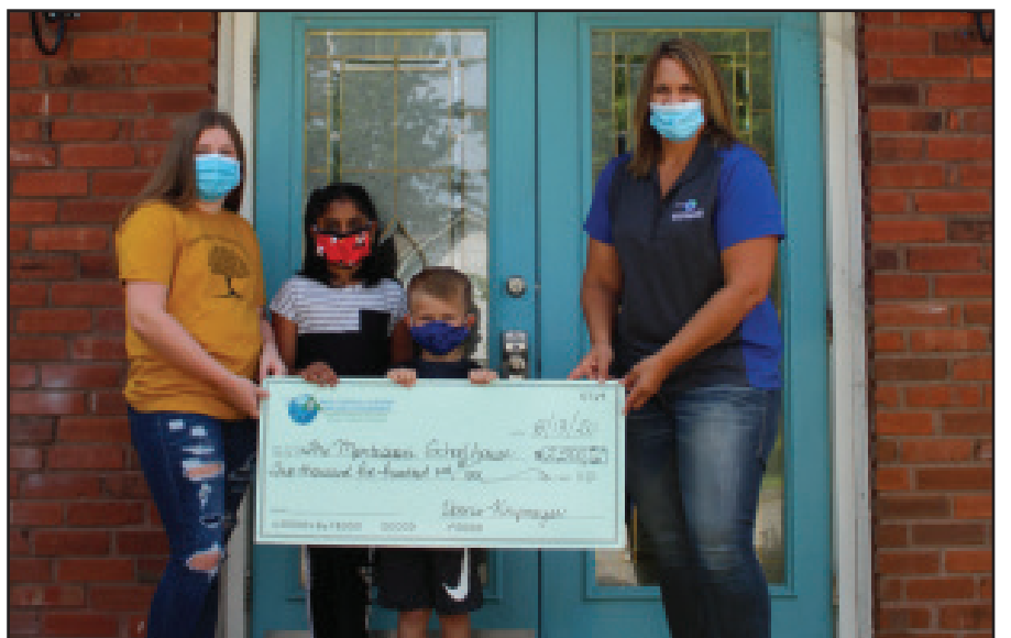
Higginsville Montessori Schoolhouse