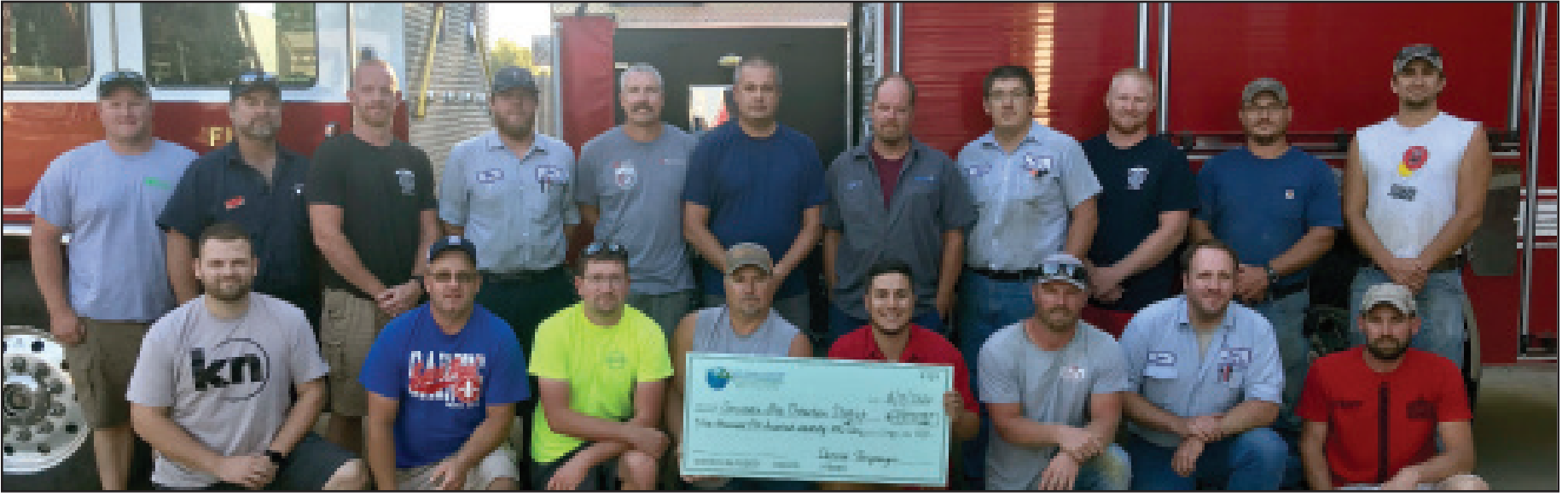
Concordia Fire Protection District