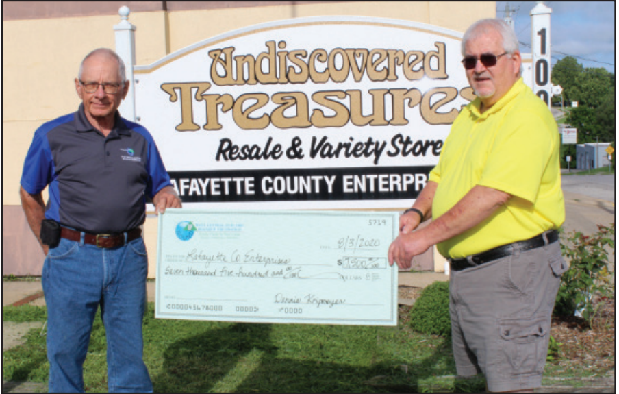
Lafayette County Enterprises