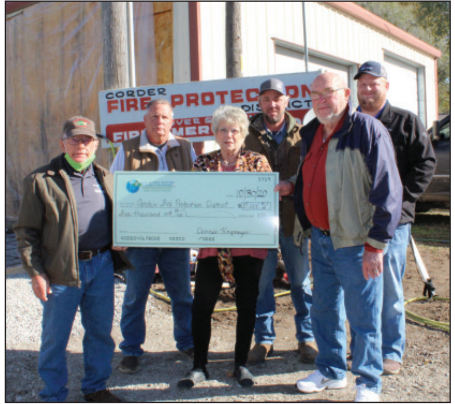
Corder Fire Protection District