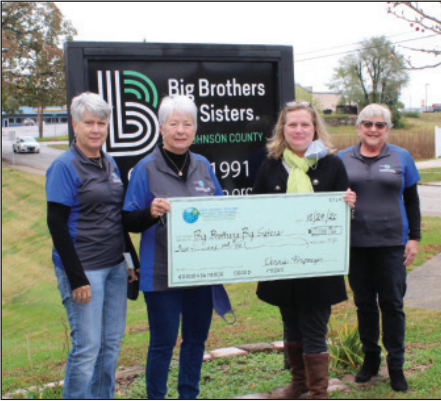
Big Brothers, Big Sisters of Johnson Co.