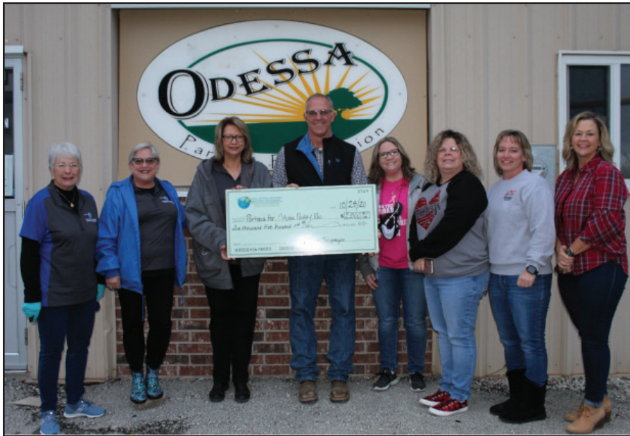
Partners for Odessa Parks & Rec.