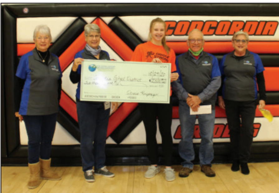
Concordia HS Stu-Co Backsnack Program